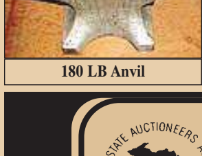
180 LB Anvil

FURNITURE: Antique marble dresser and stand, Large Oak bookcase- 1/4 sawn, Oak side by side secretary missing glass, 19th century six door chest, 1940's petite Maple cupboard, primitive painted cupboard, 1860's Walnut drop-leaf table, J.S. Rosberg Man's watch repair desk, Grey 105 TN primitive cupboard, 37" round antique table, Black smoker stand, 30" metal stool, 1926 William and Mary Walnut console table, Ingraham Art Deco clock coffee table, Kutruin floor lamp, sun bench, Herman Miller oval end table, Mahogany Chippendale highboy, blue mirror Art Deco dresser, spool leg Elizabethan table, Mission oak square table, early 19th century Windsor chair, Rider round Duncan Phyfe table, Bird's-eye maple highboy, dresser and mirror, Oak fainting sofa, 19th century handmade walnut dresser by C. Clock, Monroe MI. 2 glove drawers, backsplash and 3 deep drawers, Antique 7 drawer map chest, 1 drawer needs regluing.