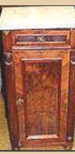
Marble Top Washstand