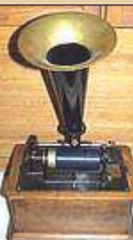
Edison Wax Cylinder Player With Horn