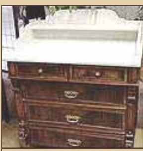
Marble Top Chest