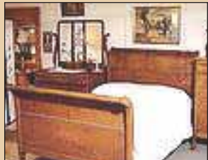
Quartersawn Oak Bedroom Set