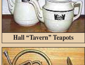
Hall "Tavern" Teapots