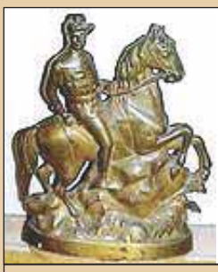
Teddy Roosevelt Doorstop