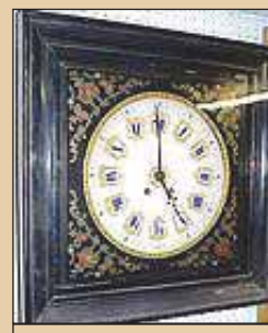
19th Century French Clock Signed CW