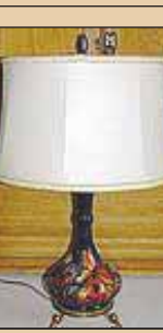
Wonderful Moorcroft Lamp