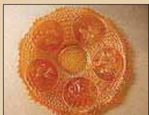
1 Of Several Nice Carnival Pieces