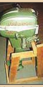
Johnson Seahorse 1/2 HP Motor