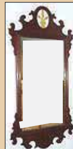
Wallace Nutting Mirror

There will be rest rooms and lunch service available. Cash, Check and Major Credit Cards