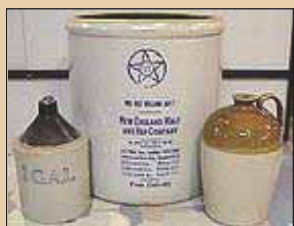
Nice Group Of Crocks