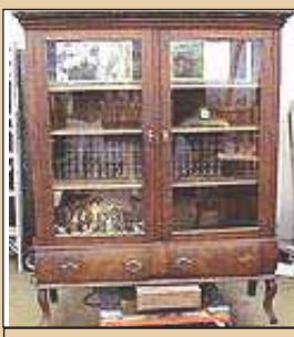
Quartersawn Oak Bookcase Great Shape