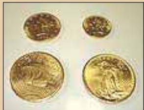
4 - US Gold Coins