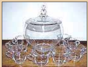
Rare Candlewick Punch Set