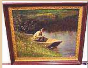
McMahon Oil 20x24" Dated 1897