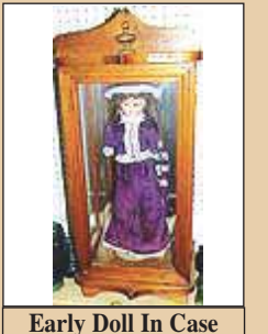
Early Doll In Case Owned By Washington's Mother