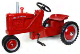
Farmall 200 narrow front steel Pedal tractor