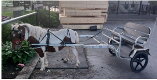
2yr old gelding pony Peaches with new cart and harness