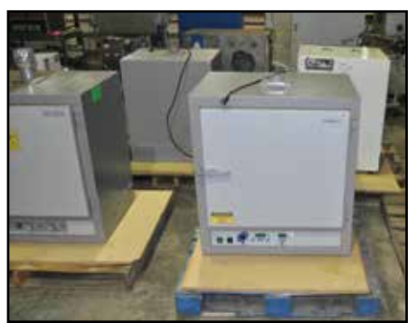
VWR Signature Gravity Convection Oven