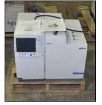
BRUKER 450 Gas Chromatograph