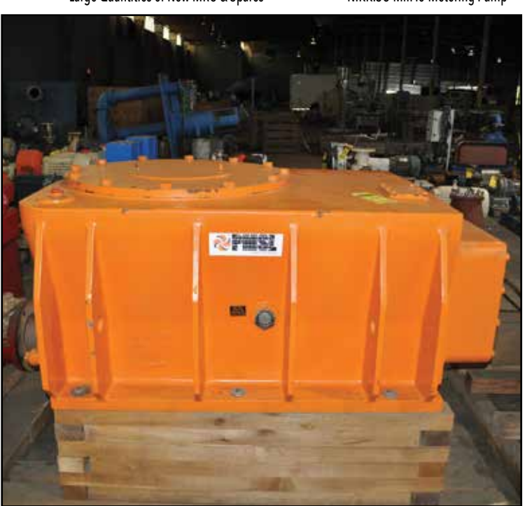
PHILADELPHIA MIXING SOLUTIONS HPTE-24 Agitator Mixer Drive - Remanufactured

SWECO Stainless Steel Dewatering Conveyor • INSTAPAK Insight Speedy Packer Foam in Bag Packaging System • NIB ENDRESS HAUSER Tank Level Transmitters • MICRO MOTION CMF200 Hast-C Flow Meter • (3) FMC Syntron Magnetic Feeders • Large Quantities of Stainless Steel Filters • NEW FLOWSERVE Stainless Steel Actuated Control Valves • (50+) FISHER, FLOWSERVE, KEYSTONE, VELAN & JAMESBURY Valves • Large Lots of Instrumentation (MICRO MOTION, ROSEMOUNT, ENDRESS HAUSER, GE & SIEMENS)