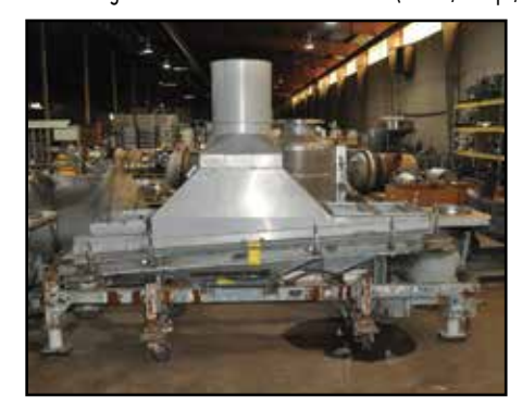
ROTEX 102" x 28" SS Deck Screener