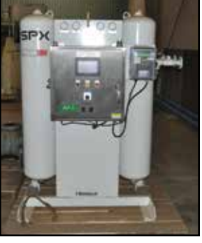
DELTECH SPX Breathing Air Purifier