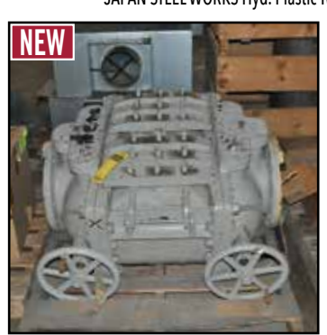
TATE ANDALE 10" Duplex Strainer