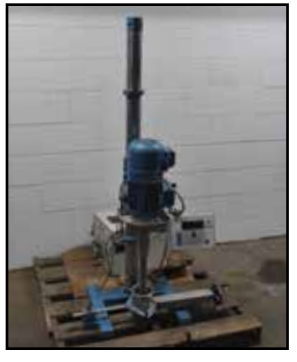
DISPERMAT DISSOLVER Disperser\Dissolver