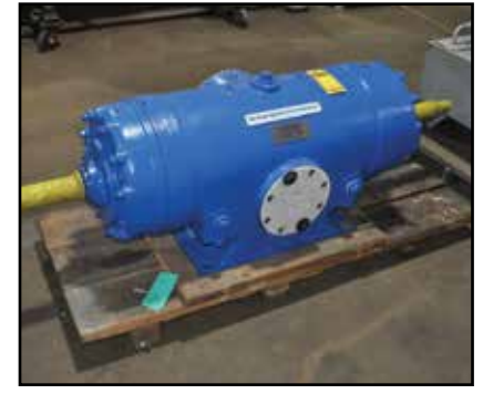
GE ENERGY Ro-Flo AC Compressor Vacuum Pump