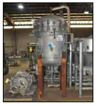
PLENTY Stainless 8-Bag Filter