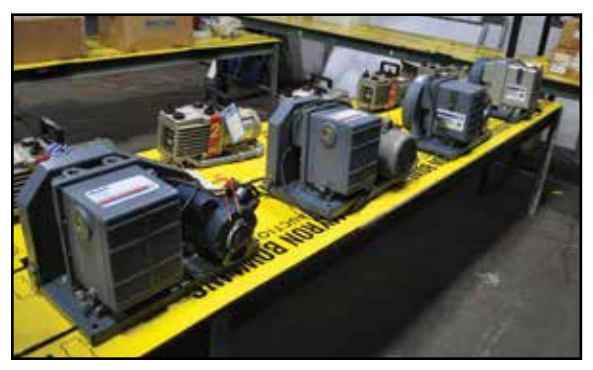
(10+) WELCH Vacuum Pumps