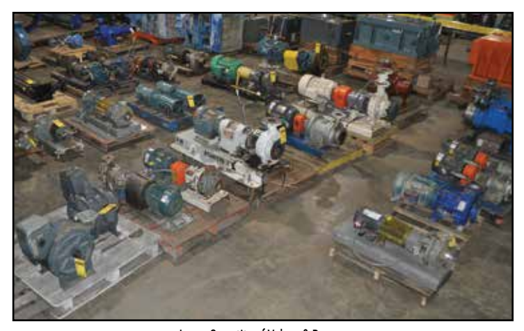
Large Quantity of Valves & Pumps