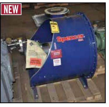
SPENCER G-1205-H MOD 5 HP 3 PH Gas Booster