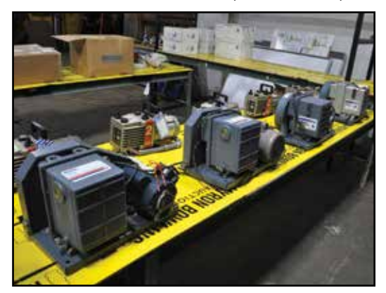
(10+) WELCH Vacuum Pumps