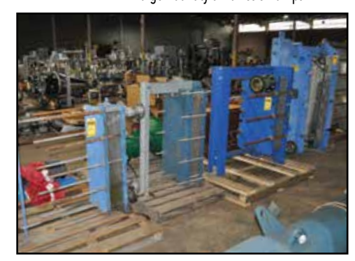
(10+) Plate & Frame Heat Exchangers