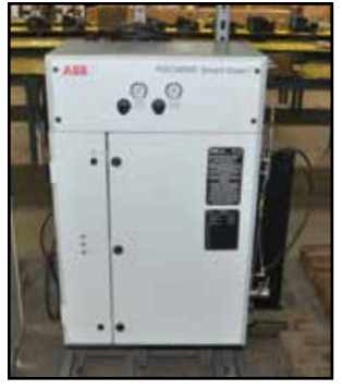
ABB PGC5000C Smart Oven