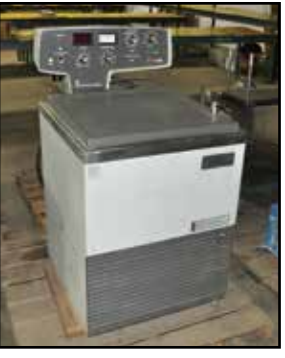
DAMON \ IEC DPR6000 Centrifuge