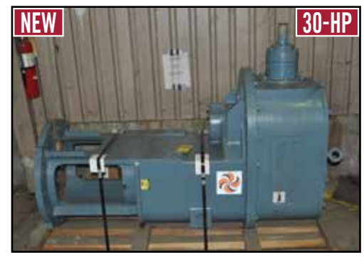
PHILADELPHIA MIXING SOLUTIONS Agitator Mixer Drive