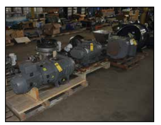
EDWARDS 15-HP 6" A30756982XS Vacuum Booster Pump