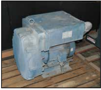
ROTRON 4" Regenerative Blower