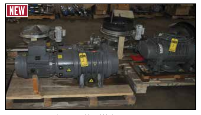
EDWARDS 15-HP 6" A30756982XS Vacuum Booster Pump