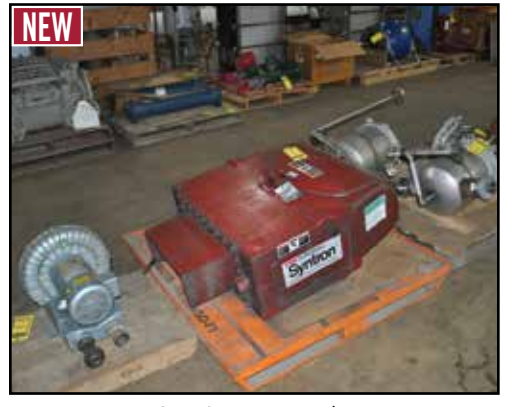
SYNTRON Magnetic Feeder