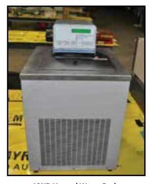
VWR Heated Water Bath