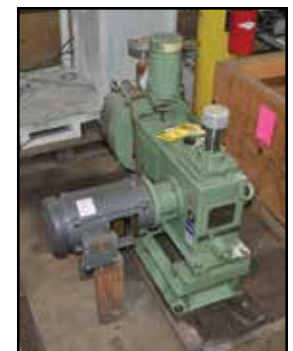
NIKKISO MilFlo-Metering Pump