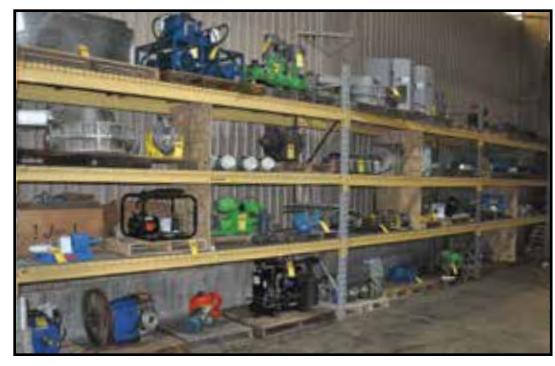
Large Quantities of NEW MRO / SPARES (Valves, Pumps, Instrumentation)