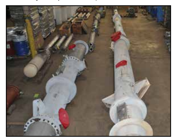
Large Shell & Tube Heat Exchangers

Inspection: Mon 10/11-Fri 10/15 & Mon 10/18-Thur 10/21 from 9AM-4PM or by Appointment. Visit MyronBowling.com for details.