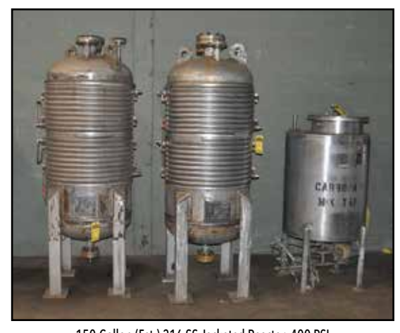
150-Gallon (Est.) 316 SS Jacketed Reactor, 400 PSI