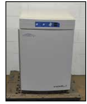
VWR Symphony CO2 Incubator