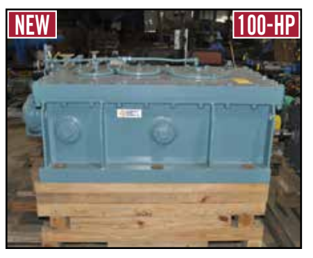
PHILADELPHIA MIXING SOLUTIONS Agitator Mixer Drive