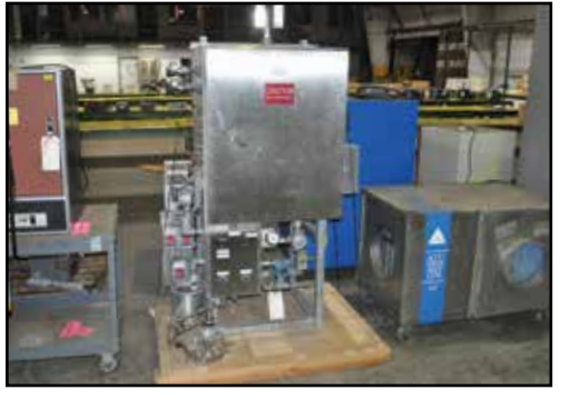
AGILANT Gas Chromatograph Sample System