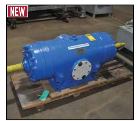
GE ENERGY Ro-Flo AC Compressor Vacuum Pump