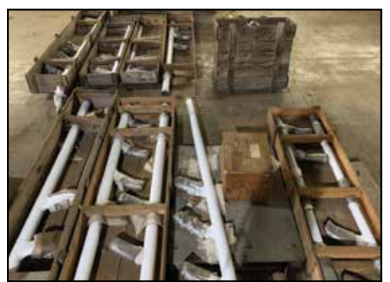
Glass-lined Agitators and Baffles