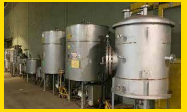
RAS Process Alloy-20 Reactors

Mon 10/11-Fri 10/15 & Mon 10/18-Thur 10/21 from 9AM-4PM or by Appointment. Visit MyronBowling.com for details.