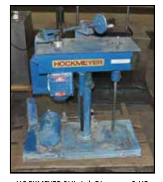
HOCKMEYER 2HL, Lab Disperser, 2-HP