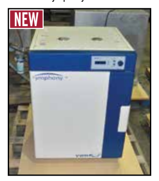
VWR Symphony General Incubator