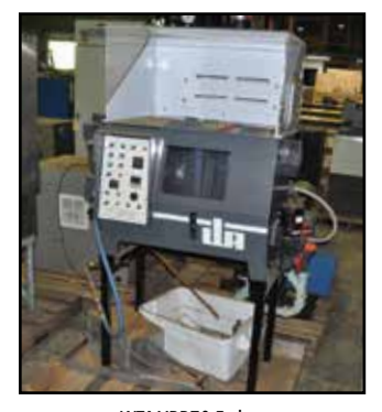
WTA VRP70 Etcher