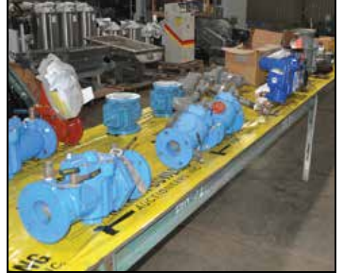
Large Quantities of New MRO & Spares