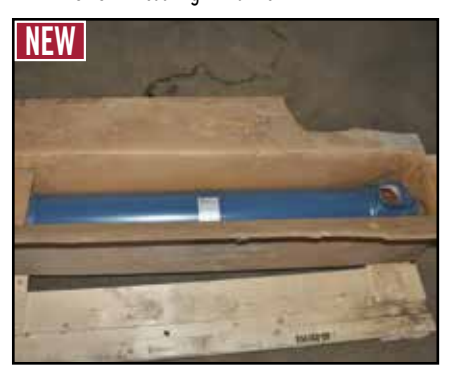
ITT STANDARD BCF Shell & Tube Heat Exchanger