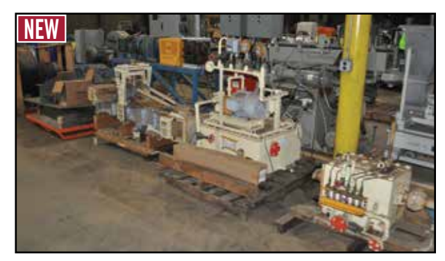
JAPAN STEEL WORKS Hyd. Plastic Twin Screw Extruder