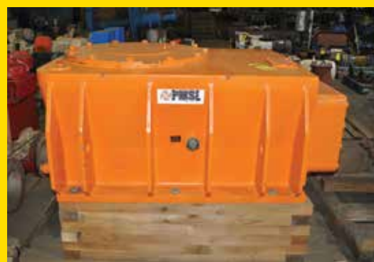
PHILADELPHIA MIXING SOLUTIONS HPTE-24 Agitator Mixer Drive - Reman.