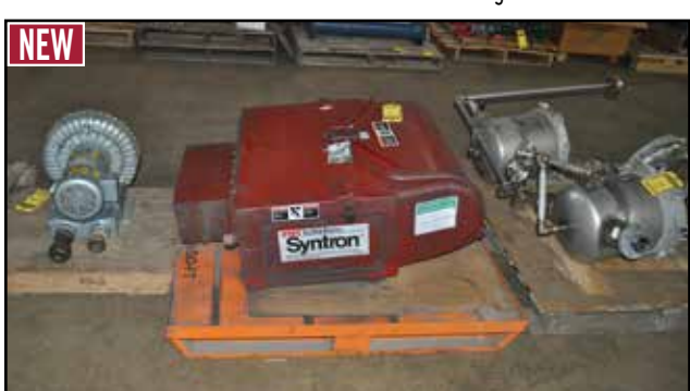
SYNTRON Magnetic Feeder