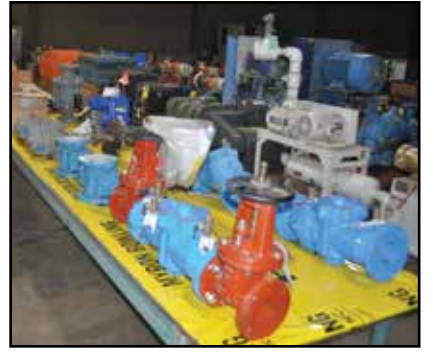
Large Quantities of New MRO & Spares