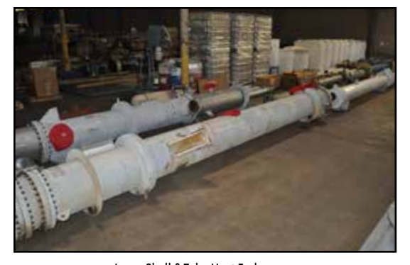
Large Shell & Tube Heat Exchangers