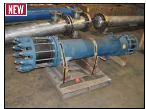
POLYTUBE Graphilor Graphite Shell & Tube Heat Exchanger