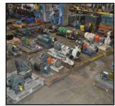
Large Quantity of Valves & Pumps