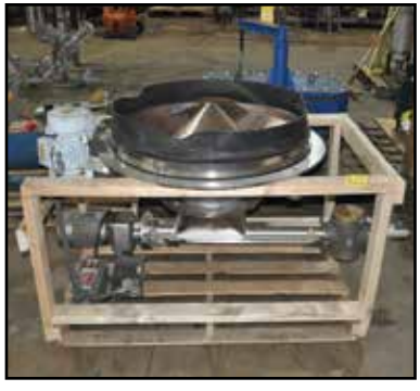
AZO SS Live Bin Bottom Screw Feeder