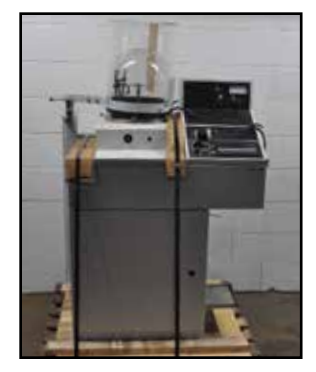
EDWARDS Auto 306 Carbon Coater