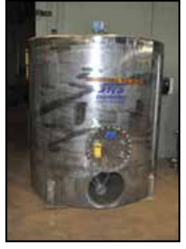
SRS CT-1500 316 SS Storage Tank