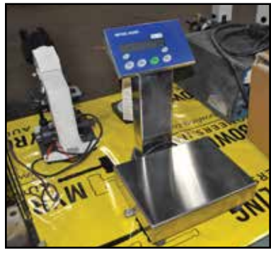
(6+) Digital Scales