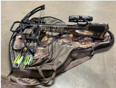
Barnett Quad 400 Crossbow

Buyers of guns will be required to complete a background check before receiving possession of guns. $20/gun for background check, paid by buyer.